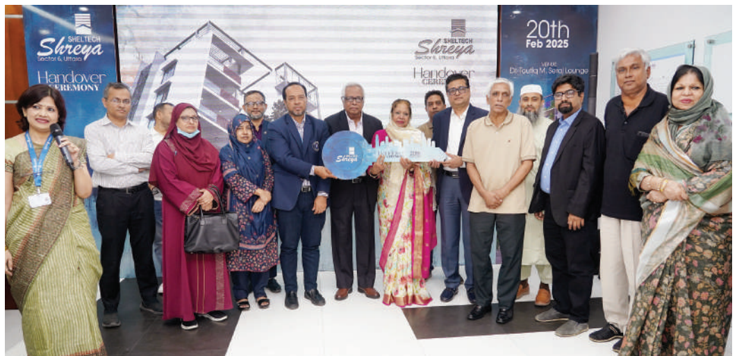
Handover Ceremony of Sheltech Shreya

Scan the QR Code to watch the project video of Sheltech Shreya