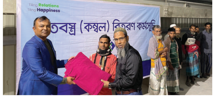
Blankets Distribution in Bhola, Barishal

Sheltech Ceramics remains dedicated to sustainable community development, reinforcing its commitment to corporate social responsibility.