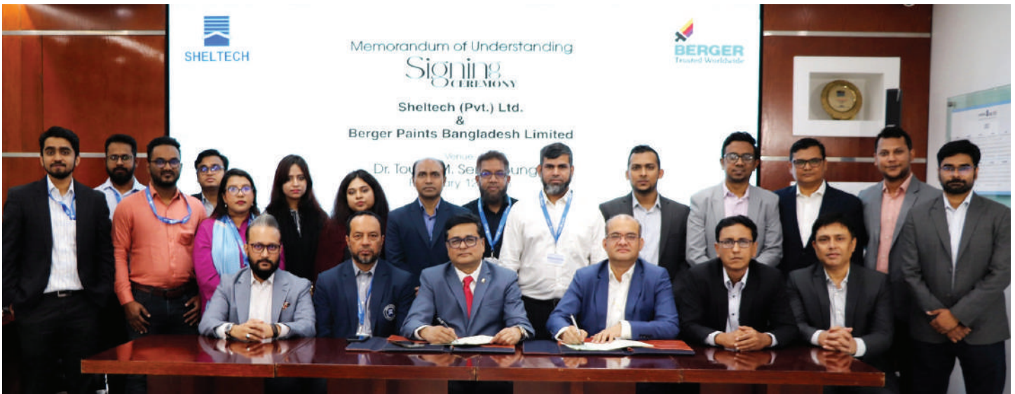
Sheltech Management and High Officials from Sheltech and Berger Paints at the MoU Signing Ceremony at Dr. Toufiq M. Seraj Lounge in Panthapath