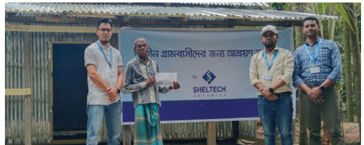
Homes Handover to Homeless Villagers at Bhola