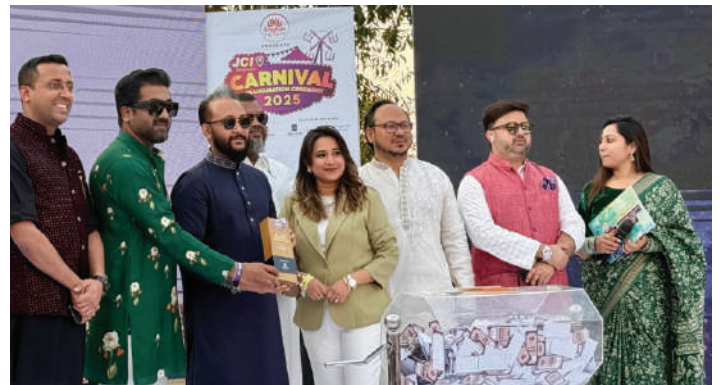
Sheltech Management and Officials along with Guests at the JCI Bangladesh Carnival 2025

Furthering Sheltech's dedication to youth leadership, Sheltech participated as the Platinum Sponsor of the JCI Bangladesh Carnival 2025 on February 7, 2025. The event gathered young leaders, entrepreneurs, and professionals for networking, innovation showcases, and musical performances. Sheltech's interactive stall was a highlight, engaging visitors and promoting forward-thinking as well as sustainable initiatives.