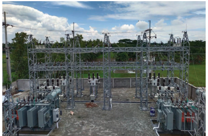
Installed 132/33kV Substation at Comilla

The agreement was signed on January 15, 2025 which marks a significant step in enhancing rural electrification infrastructure. The project is set to reinforce Sheltech Technology Ltd.'s expertise in power solutions and commitment to national development.