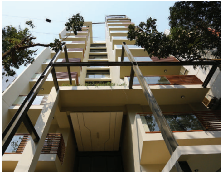
Sheltech Shreya-a Modern Residential Project at Sector- 6, Uttara