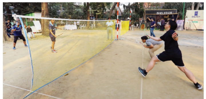
Sheltech Management and Officials, Participants, and Guests at the Vibrant Baridhara Badminton Tournament 2025