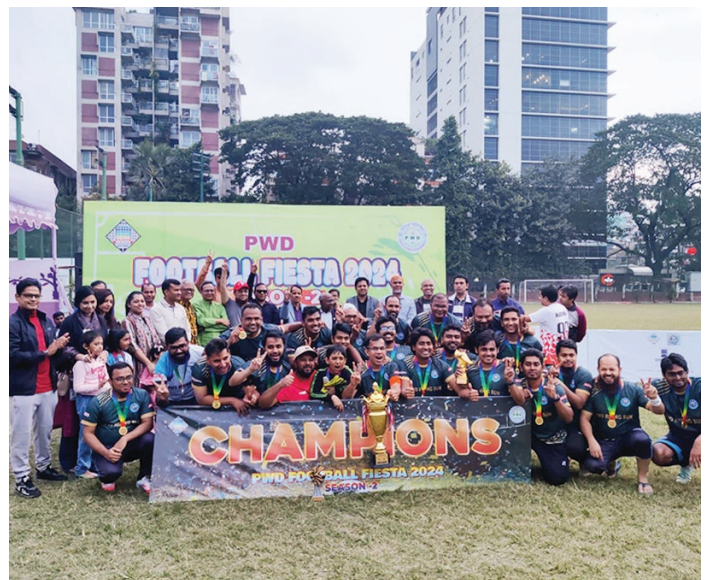
PWD Football Fiesta 2024

As a socially responsible organization, Sheltech actively promotes community well-being by supporting events that encourage unity, healthy competition, and personal development. From sports initiatives to educational and environmental programs, Sheltech's sponsorships are always aimed at building a stronger, more connected society.