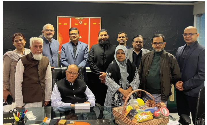
Agreement Signing Ceremony of Sheltech Capital Center at Kakrail