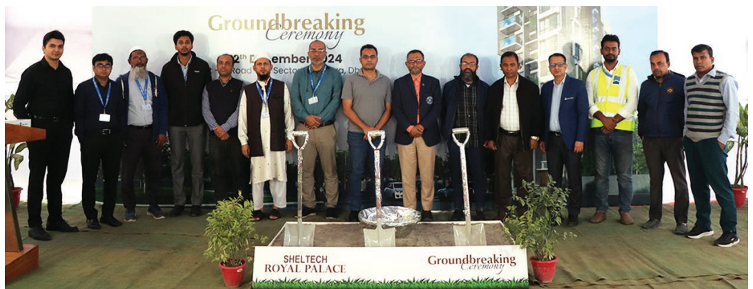
Ground Breaking Ceremony of Sheltech Royal Palace

each measuring 2300 sft., on a 5.20 Katha land area. Located in Uttara's sophisticated neighborhood, the project promises a serene and upscale living environment. For more details, please call 16550 .