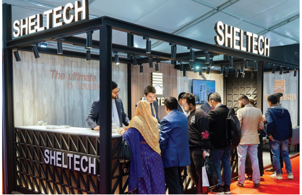
Clients are Interacting with the Dynamic Sales Team of Sheltech at Sheltech Stall in the REHAB Fair 2024

As a pioneer in the real estate industry, Sheltech offers a wide range of premium residential and commercial projects that cater to modern living and business needs. At the fair, visitors can meet Sheltech's experienced team, explore project details, and find tailored solutions for their property needs. Whether you're looking for a luxurious apartment or a commercial space in Dhaka's prime locations, Sheltech provides opportunities to invest in properties that combine sophistication with functionality. For more