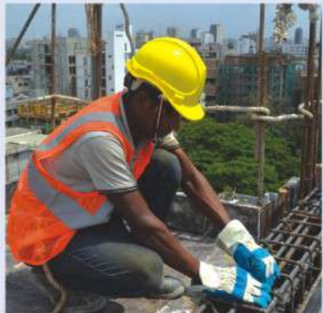
PPE (helmet, hand gloves, safety vest, safety belt and safety shoes) worn by worker while binding reinforcement at Sheltech Ayaan at Banani 11

We wish to congratulate all the technical personnel at Sheltech Ayaan and Sheltech Renu-Kabir Tower, for scoring the highest in our internal safety competition for the month of April 2019. Sheltech Ayaan is our south facing, corner plot, commercial project in the heart of Banani 11, while Sheltech Renu-Kabir Tower is our beautiful gated community at North Badda, with 115 innovatively designed apartments and a large children's play area spanning over 5 katha. Winning the internal competition means compliance of all Sheltech safety rules, which includes site cleanliness, proper installation of safety features, proper use of PPE (personal protective equipment) and frequent safety training of all construction workers. We encourage our clients to come see these beautiful projects for themselves and join Sheltech in our efforts to bring about international safety standards to the construction industry in Bangladesh.