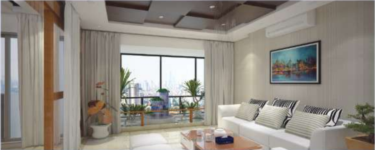
Sheltech Nurjahan will feature 17 luxury apartments in Banani

10-storied (B+G+9) building, with 17 luxury apartments. Located in Banani 05, this project is close to the Banani Lake and all urban conveniences of Banani 11. We invite you to come to our office at Sheltech Tower, Panthapath, to see the designs and architectural layouts of this beautiful new project in Banani.