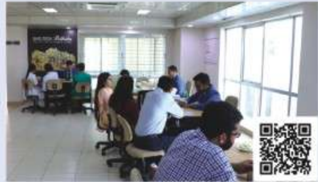
Clients at Pohela Boishakh Get Together