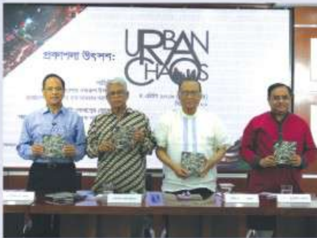
Book Publishing Ceremony at Sheltech Lounge