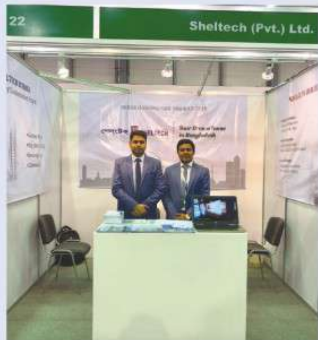
Sheltech Stall in the Rehab Fair at Sharjah

Sheltech participated in the REHAB Housing Fair at Sharjah, United Arab Emirates on April 4 - 6, 2019. The housing fair was organized by REHAB and held at the Sharjah Expo Center. During the three-day event, we had many non-resident Bangladeshi (NRB) clients visiting the fair, to search for a home in their motherland. Our ready, condominium project, Sheltech Bithika in Mirpur, was a hit with our clients for the complete lifestyle it offers with its ready apartments, abundance of community facilities and its close location to the upcoming Metro Rail in Dhaka city. Our lakeside luxury projects in Dhanmondi 32 and New Eskaton, and our 4 bedroom, single unit, luxury project in Banani were also in high demand at the fair. For our NRB clients who missed out on the Fair, but are looking to make a lifetime investment in their dream home, contact our sales team today through +8801713091704. We are also available on Viber and Whatsapp through this number.