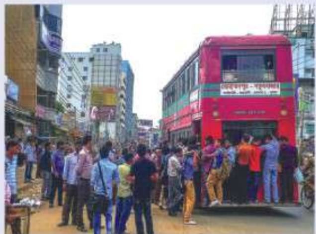
Some Pictures from the Photo Book, Urban Chaos